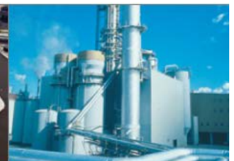
Pulp and Paper